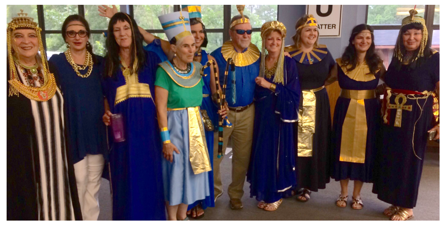
Mystic order of COLONY! Words cannot express nor identify.