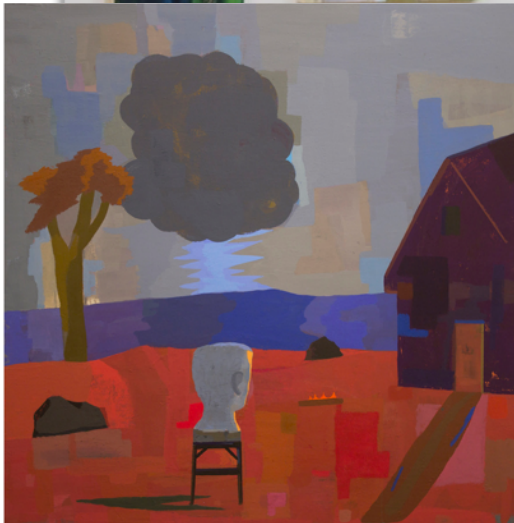
These Numbered Days