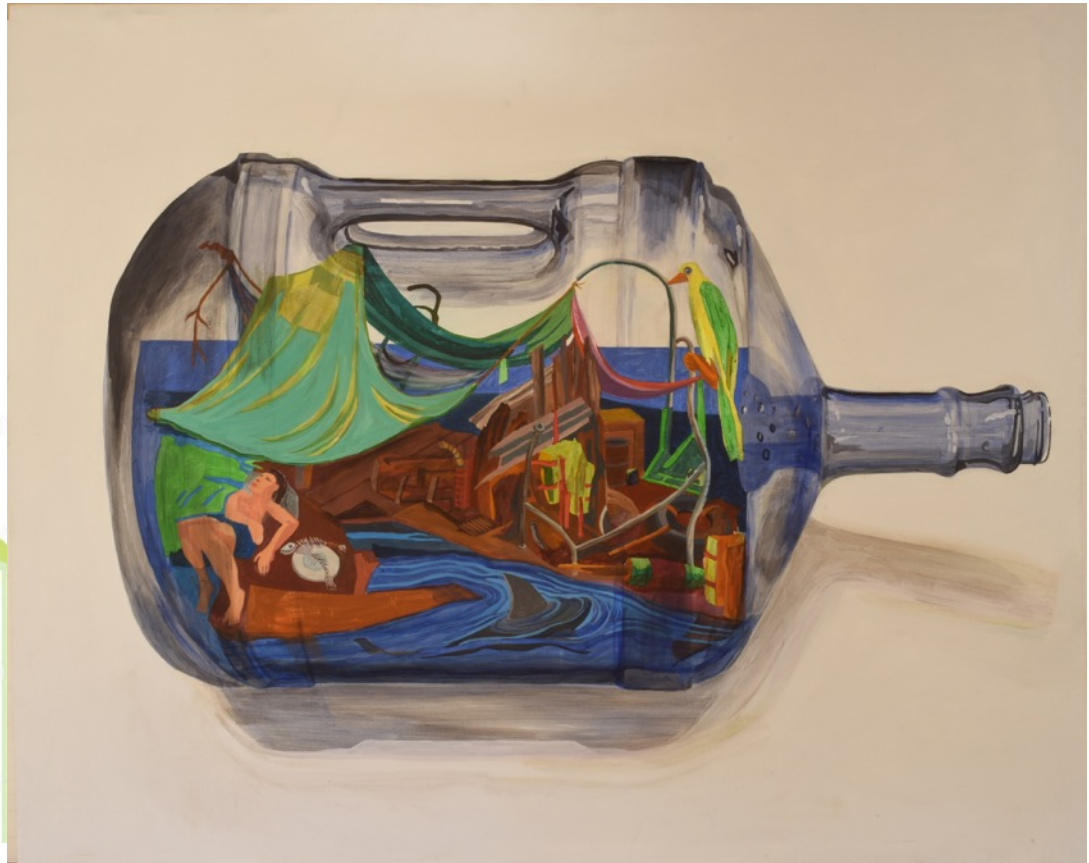
“Raft in a Bottle”